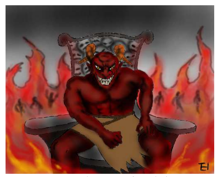
There is a cost for sin!