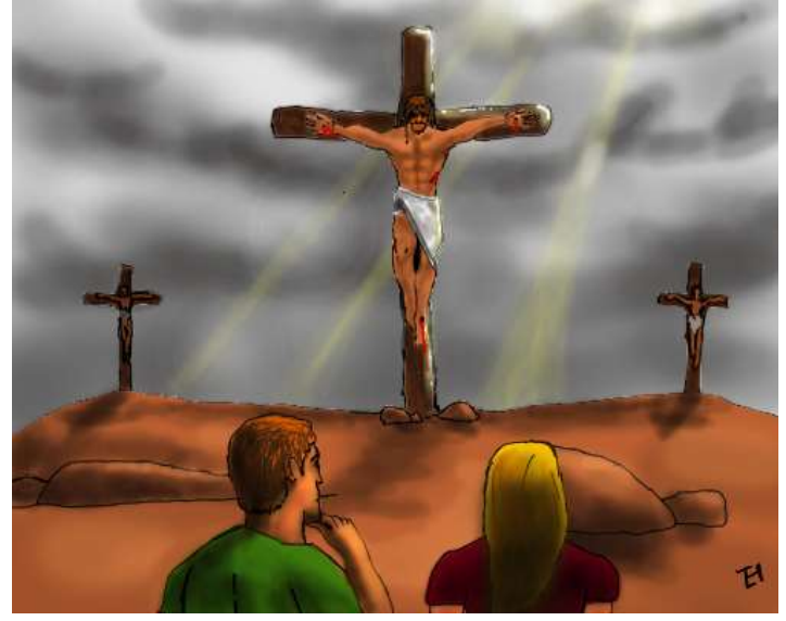
Why did Jesus die?