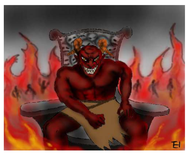
There is a cost for sin!

Johani 3:36 Iye unogalamoyo mu Nkololo una butjilo gusingapele, koga iye usingahwilile Nkololo aatowobe ne butjilo, koga bushongola gwe Ndzimu gupezhugwi kukwe.