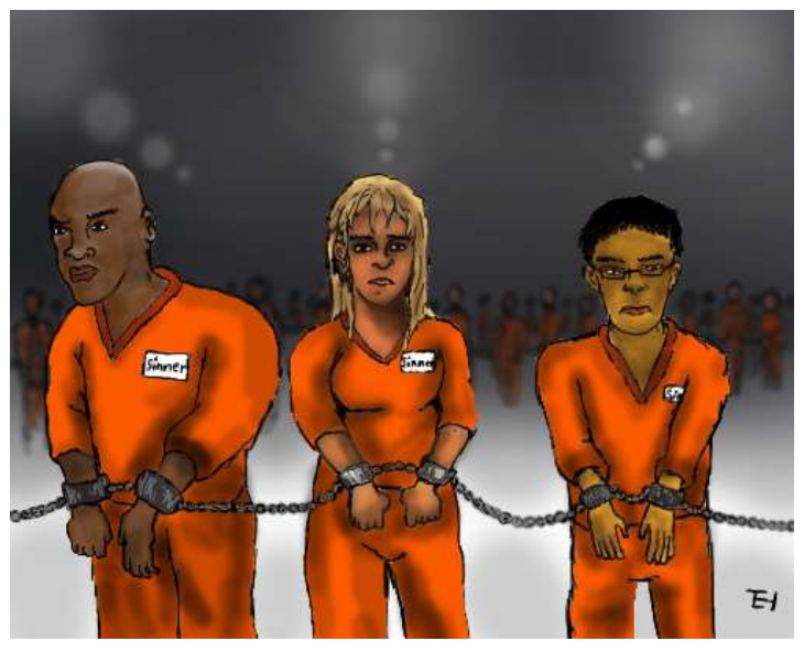
We are all sinners!

Baroma 3:23 se bathu bose bakatjinya bakathayela gudzo le Ndzimu.