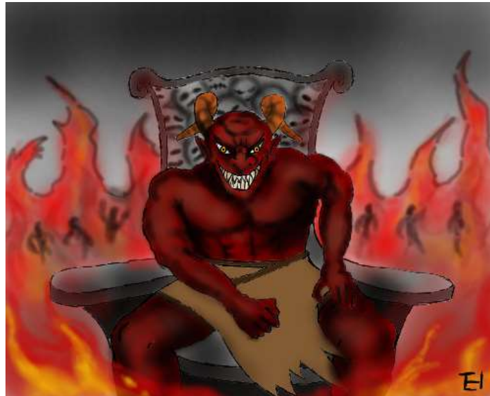
There is a cost for sin!

John 3:36 መገን ቤቶን አመዕነኖ ዶሊ ሆረንከ ሄአ ሄቸተ ደቀኖ። ቤቶን አመዕኑምበሀን አሌን መገን አሙርት ድርታስ በጋን ዶሊ ሆረንከ ሄአ ሄቸተ ደቀኖበአ።