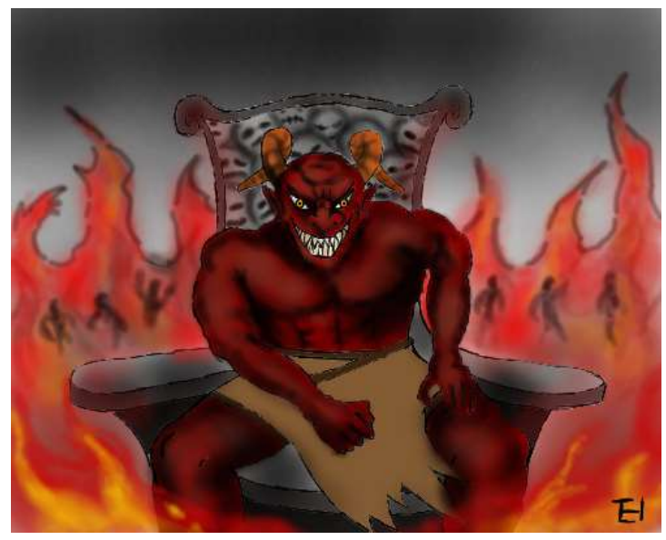
There is a cost for sin!

Yohanna 3:36 Weena oghu akuhikilija Mwana oghu akutunga bwomiili butahuw'o, bhaatu weena oghu akubhenga kuhikilija Mwana oghu taakutunga bwomiili butahuw'o, kandi Luhanga akuukala amughiliiye kiinigha."