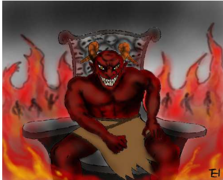
There is a cost for sin!

John 3:36 ናዓሢ ጉሙርቂ ዔከሢከ ናንጊና ናንጊ ዓኣኔ፤ ናዓሢ ጉሙርቂ ዔኩዎአሢ ጋዓንቴ ፆኦሲ ዲንጋ ሜቶይዳ ናንጋንዳኣፓዓቴም ከሺ ናንጊ ዴንቃዓኬ» ጌዔኔ።