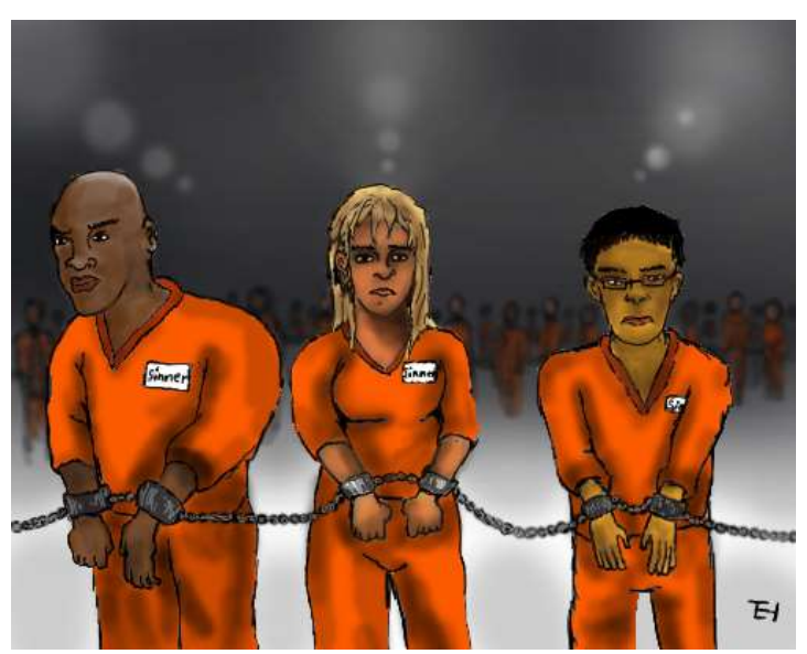
We are all sinners!

Rom 3:23 wèéa ne ga chibian kúrúa hãa, a Nqarim di x'áàn tcàoa hãa domka, 2