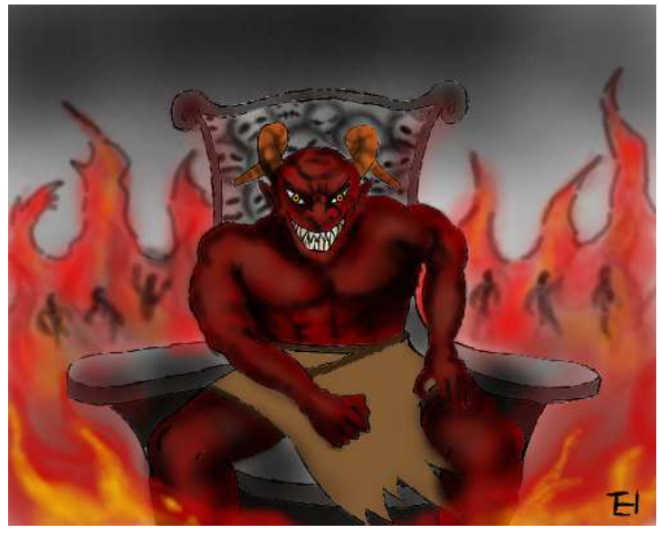
There is a cost for sin!

John 3:36 "...and he that believeth not the Son shall not see life; but the wrath of God abideth on him."