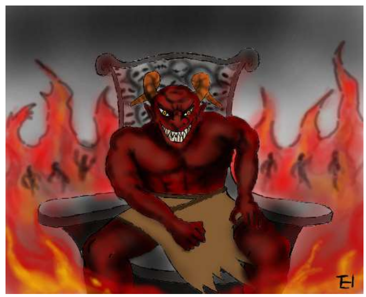
There is a cost for sin!

Johane 3:36 Awu a kholwako ka Mwanana, a ni wutomi wo mbi guma. Awu a si engisiko Mwanana, kha na mbi wona wutomi, aniko kuhenya ka Txizimu ku txitimwi kwakwe.