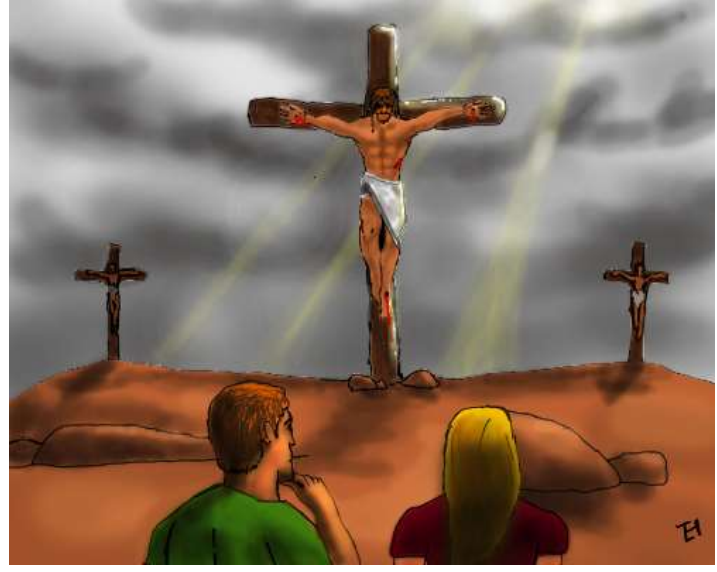
Why did Jesus die?